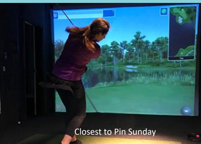
Closest to Pin Sunday