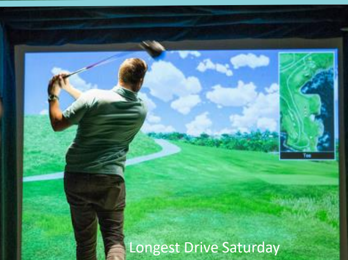
Longest Drive Saturday