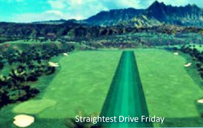
Straightest Drive Friday